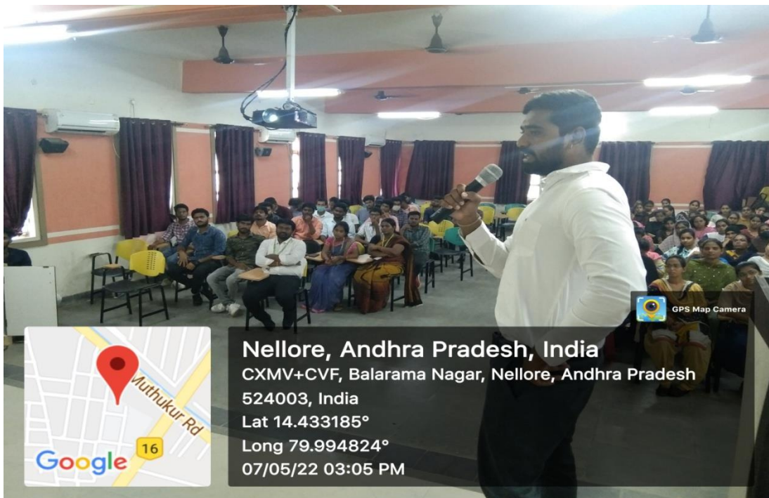
Resource person explaining about the sales Force Technology